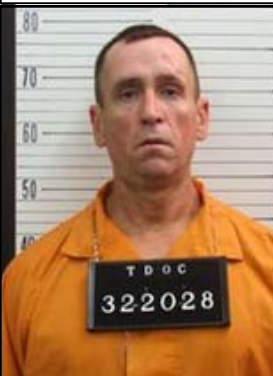
2000 D.O.C. mug